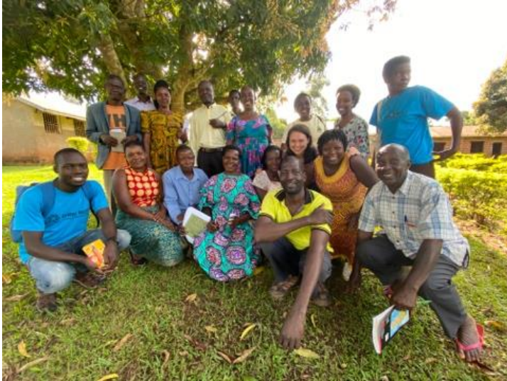
Omni Med staff and VHTs after a focused group discussion on mental health