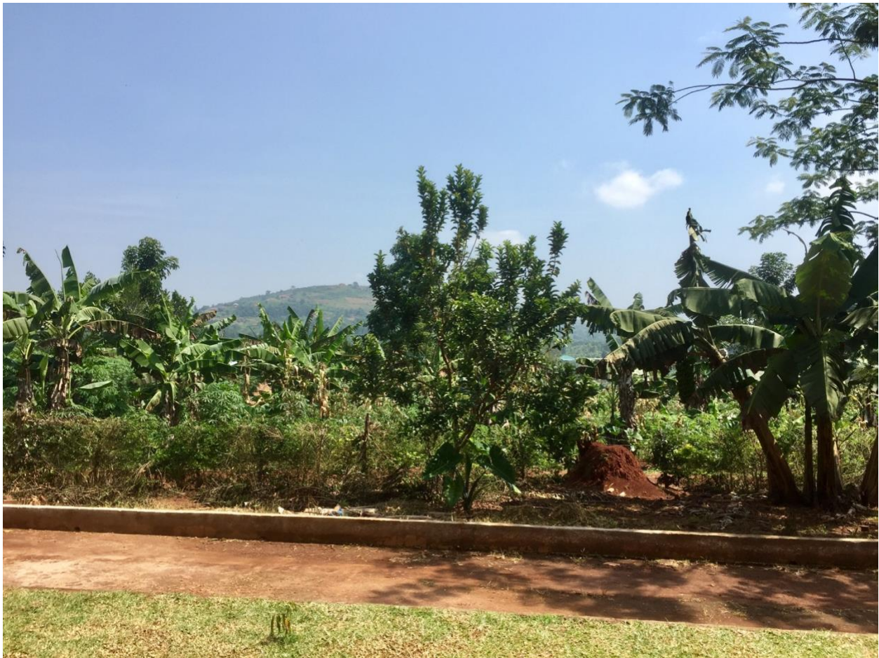
View from the Omni Med office in Makata